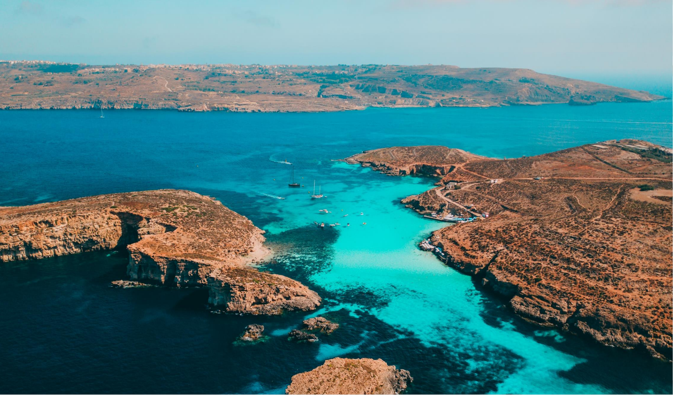
Comino and the Blue Lagoon