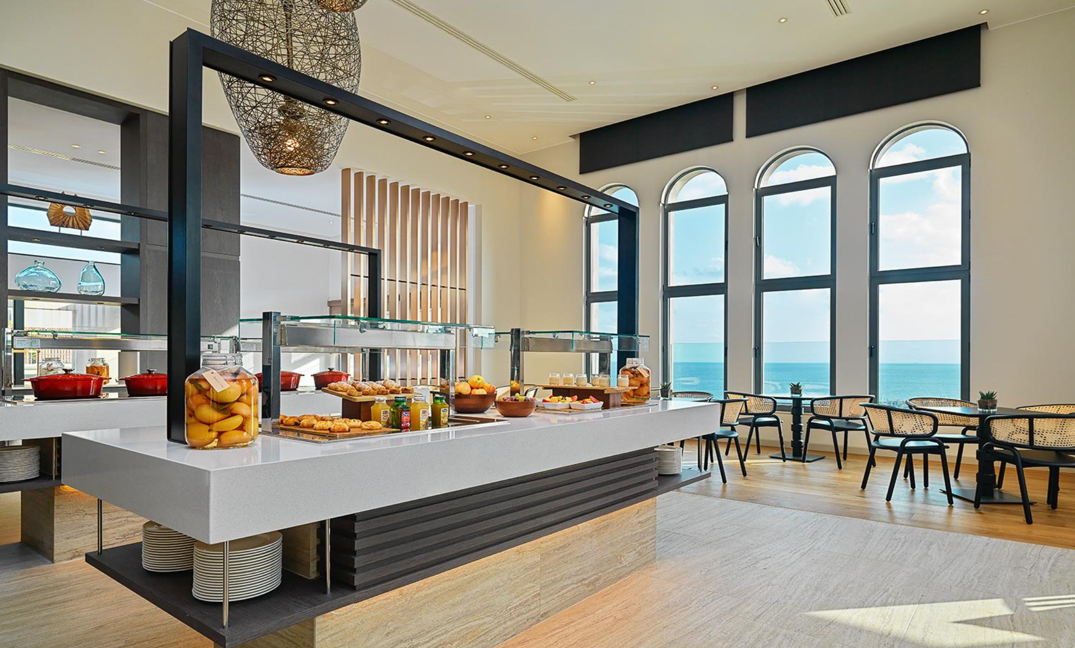
The M Club lounge is situated on the top floor of the hotel with it's own private entrance and outdoor terraces. The M Club is surrounded by the picturesque Balluta views and the Mediterranean.