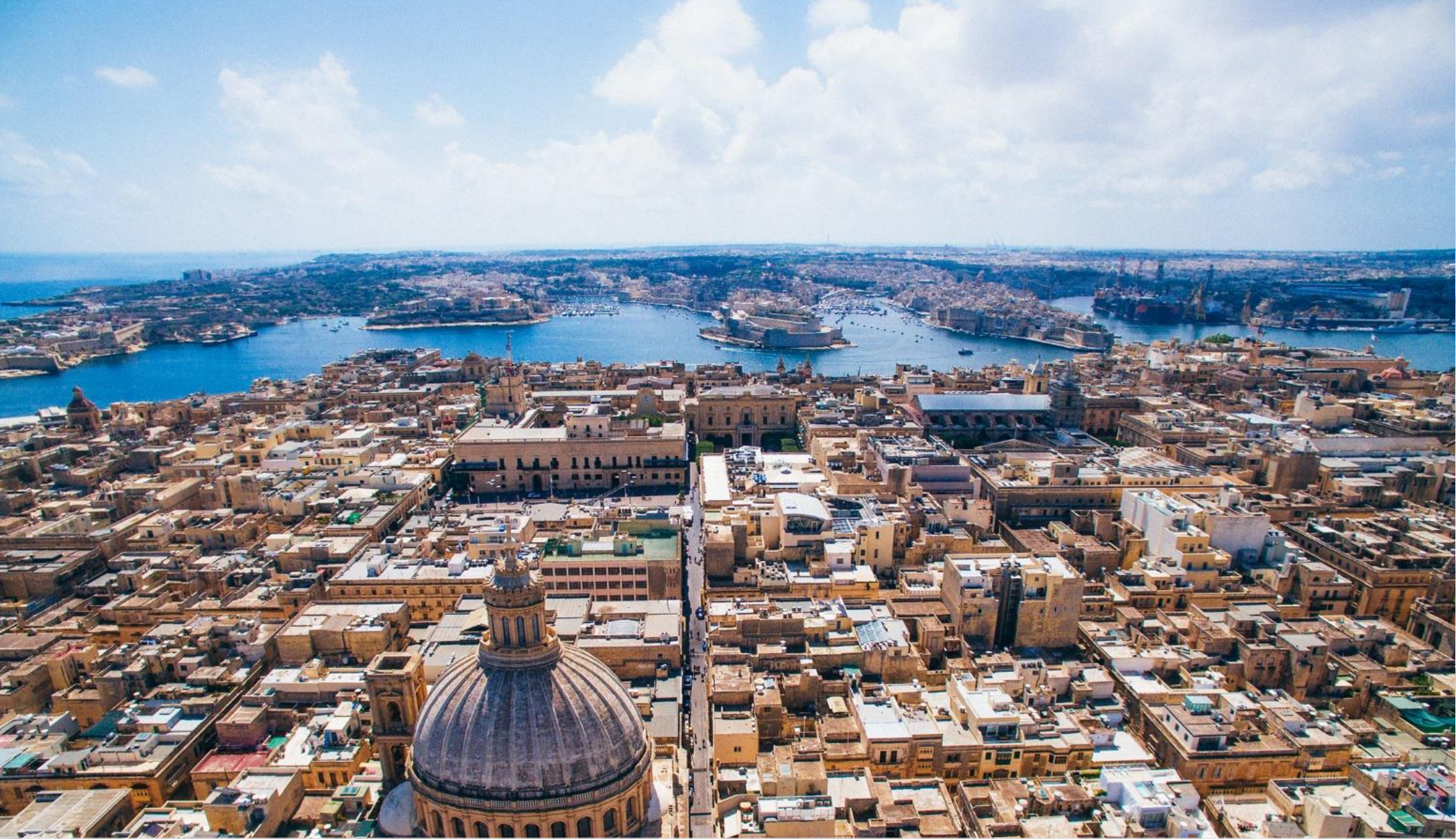
Valletta & The Three Cities